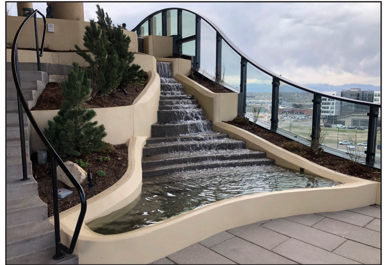
One River North's most unique feature is a 10-story canyon that runs along the building's façade, featuring Colorado-inspired landscaping, a water feature and a four-story walkway.

China-based MAD Architects and Denver-based Davis Partnership Architects are serving as architects on the project. The building is one of only two residential projects in the U.S. designed by MAD Architects, according to previous reporting. Pennsylvania-based BrightView Landscape Services and Englewood-based Bristol Botanics Inc. designed the outdoor and indoor landscaping features, respectively. ▲