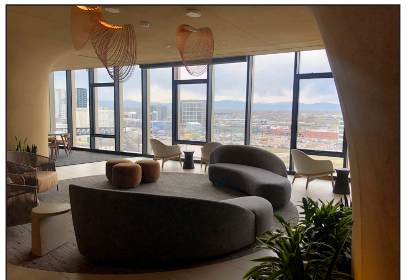
The building offers approximately 13,000 square feet of amenities, including a resident lounge and workspace.